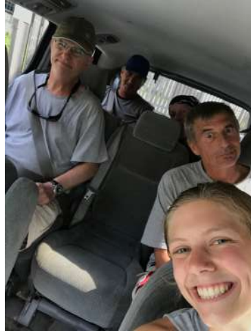
Driving a crew over to demolish the insides of the thrift store