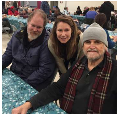
Caring for our guests