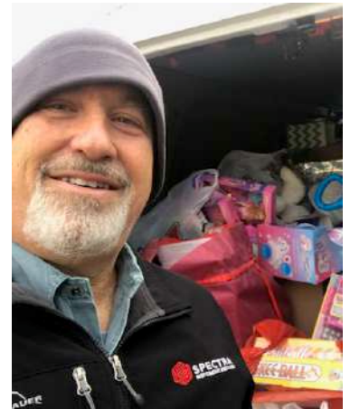
Fire Hall Pick Up