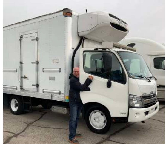
Our new truck!