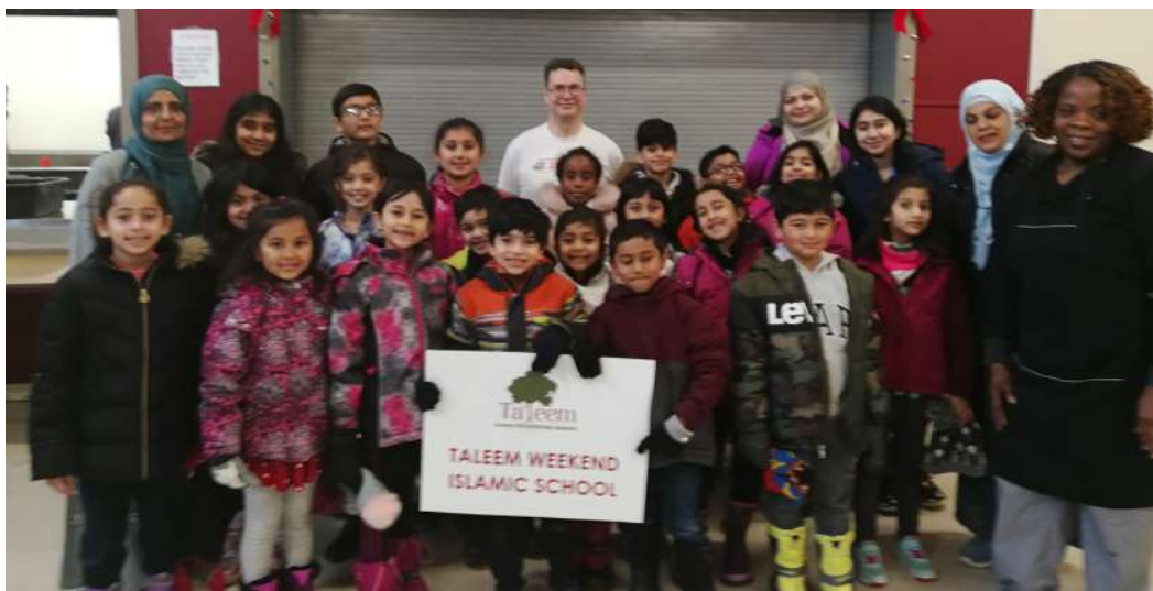
One of best day with my little volunteers