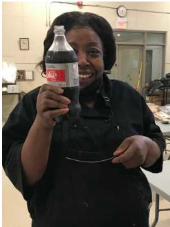
I've never worked in this type of environment before, and find the experience humbling.