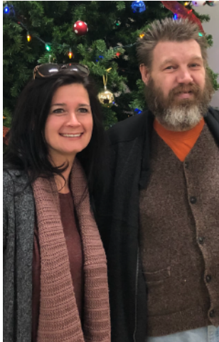
Our welcome host