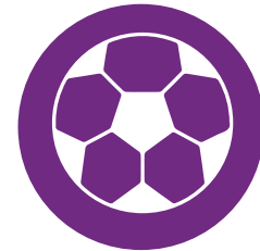
World Cup Parties