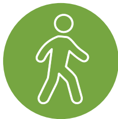
A-Thons (walk, bike, bowl, dance, study, read, etc.)