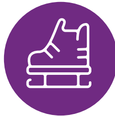
Skating or Tobogganing Day