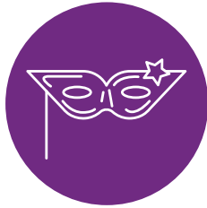
Host a Themed Party